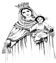
Our Lady of Mount Carmel